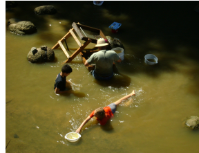
Sieving in the creek.

Rock and Gem magazine: www.rockngem.com/showdates