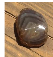
Agate, from the March auction. It appears to have been cut.